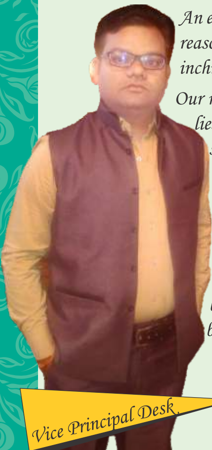
Vice Principal Desk

An educational institution aims at teaching students not just to live but to reason and analyze life. We at AGS, Ambah are working really hard and inching towards that the goal where 'life will be sweet'.